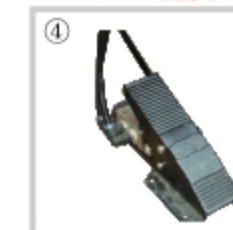
foot pedal 脚踏