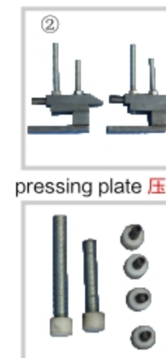
pressing plate 压具