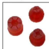
Drive pads 驱动垫