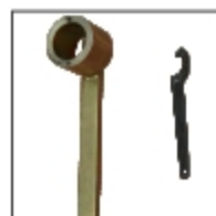
Wheel wrench 砂轮扳手