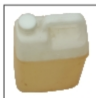
Coolant liquid 冷却液