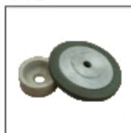
Abrasive wheel 砂轮